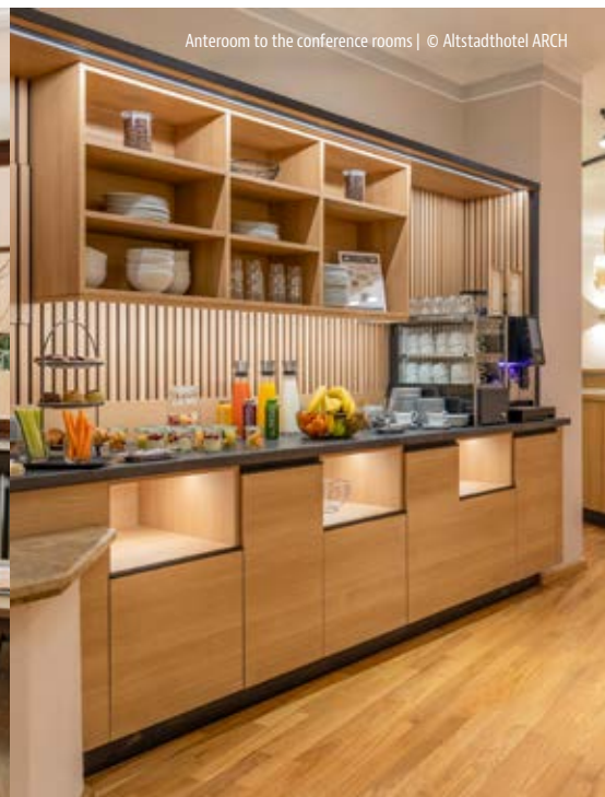
Anteroom to the conference rooms