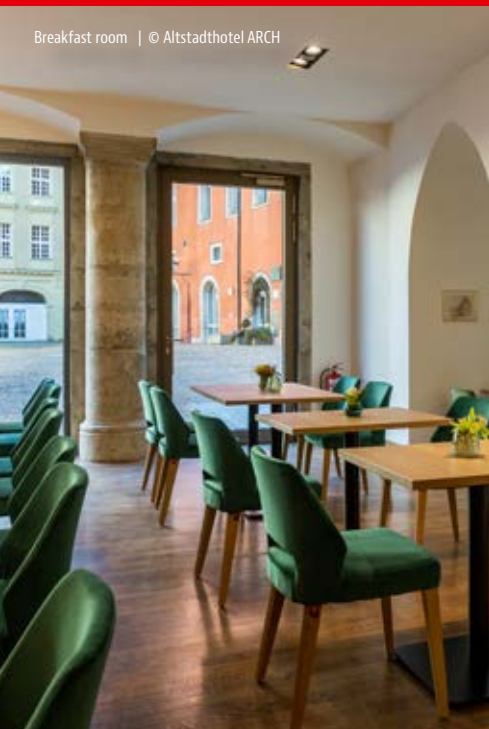
Breakfast room

The Altstadthotel Arch is located in one of Regensburg's most beautiful patrician houses and impresses not only with its excellent location, but also with its historic ambience and genuine hospitality. The four versatile conference rooms offer the perfect setting for your event. Whether for a conference, seminar, or workshop, we are at your side with professional service and modern equipment. We are happy to design a customized accompanying program for you according to your wishes, ideas, and requirements.