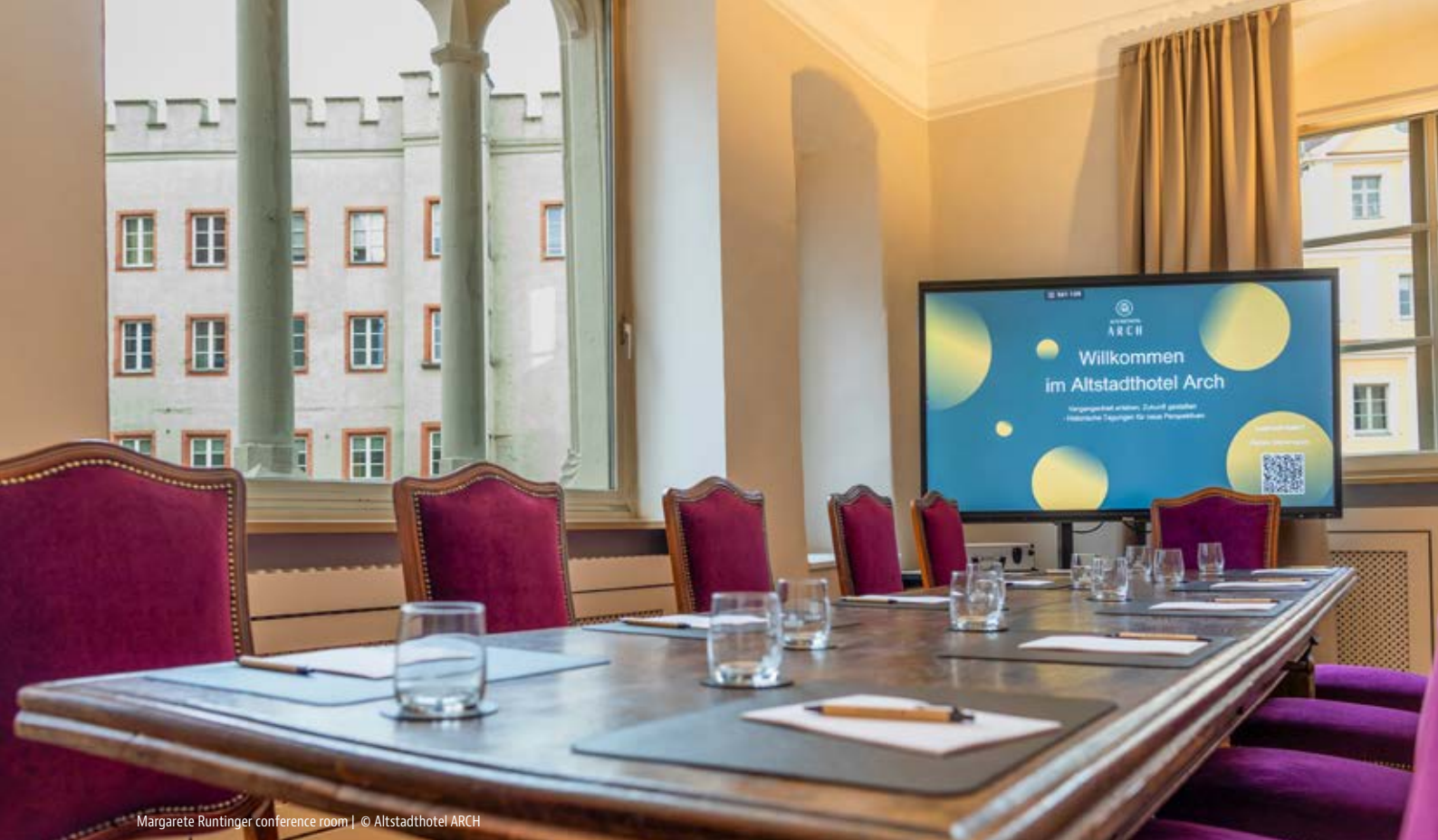
Margarete Runtinger conference room | © Altstadthotel ARCH

WELTERBE REGENSBURG UNESCO-WELTERBE | WORLD HERITAGE