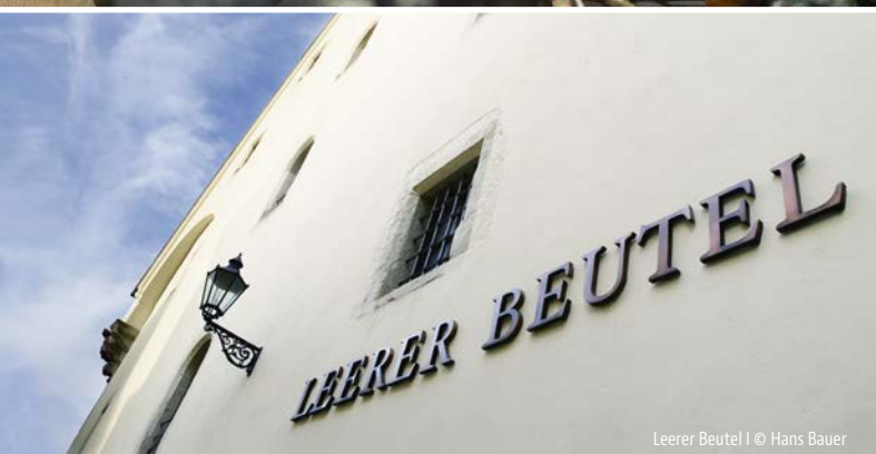
Leerer Beutel