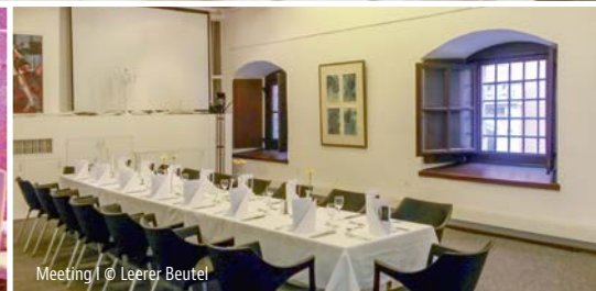
Meeting | © Leerer Beutel