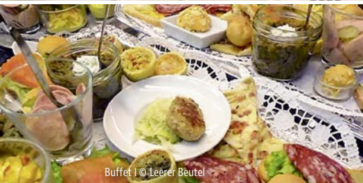
Buffet | © Leerer Beutel