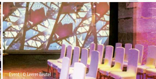
Event