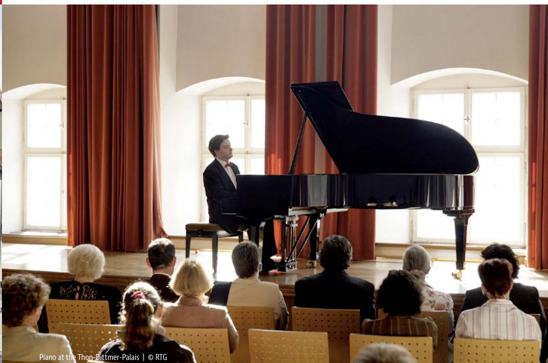
Piano at the Thon-Dittmer-Palais