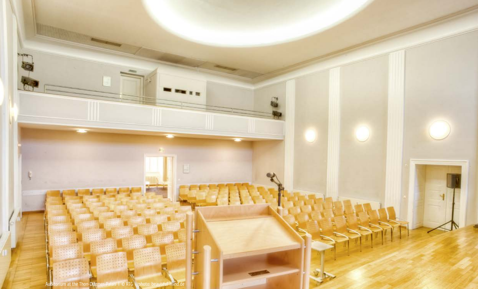
Auditorium at the Thon-Dittmer-Palais

WELTERBE REGENSBURG UNESCO-WELTERBE | WORLD HERITAGE